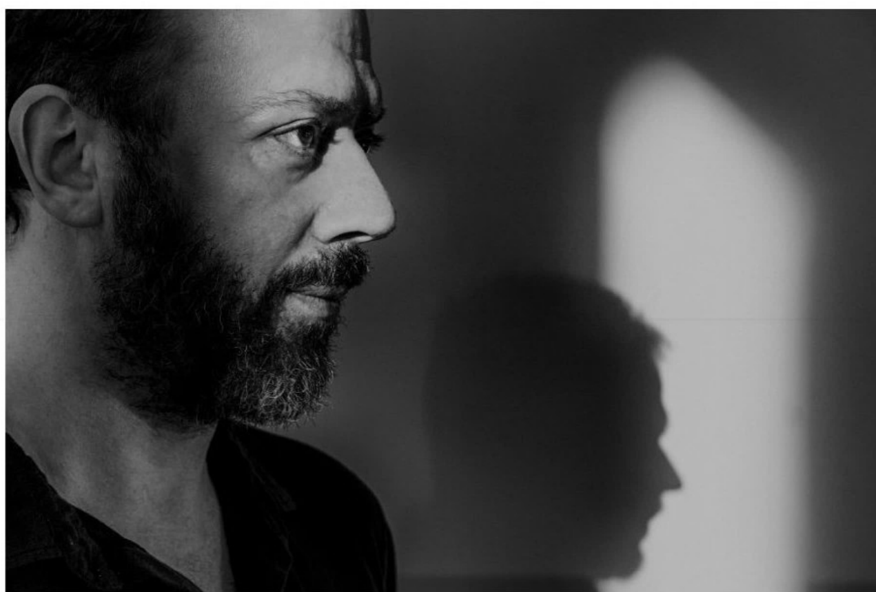
The choreographer Alexei Ratmansky said, “I looked for sounds that would fit each dancer.”

“Voices,” set to Peter Ablinger’s “Voices and Piano,” which will premiere at City Ballet’s New Combinations evening on Thursday, is a new frontier, musically, for Mr. Ratmansky — known for witty, poetic physical responses to more conventional scores and sensitive reconstructions of 19th-century classics.