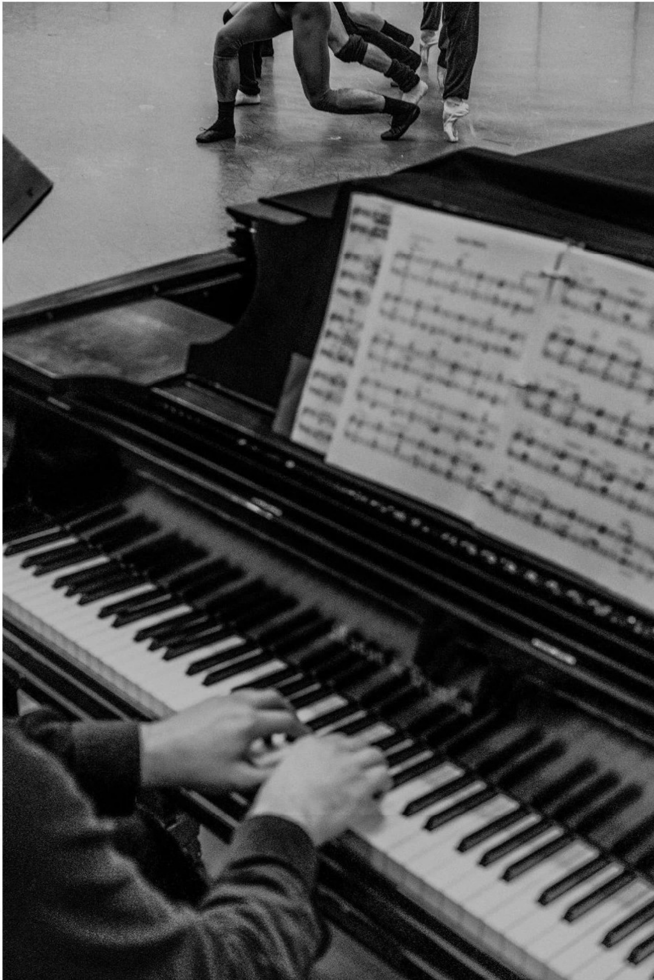
Rehearsing “Voices,” Alexei Ratmansky’s new ballet.